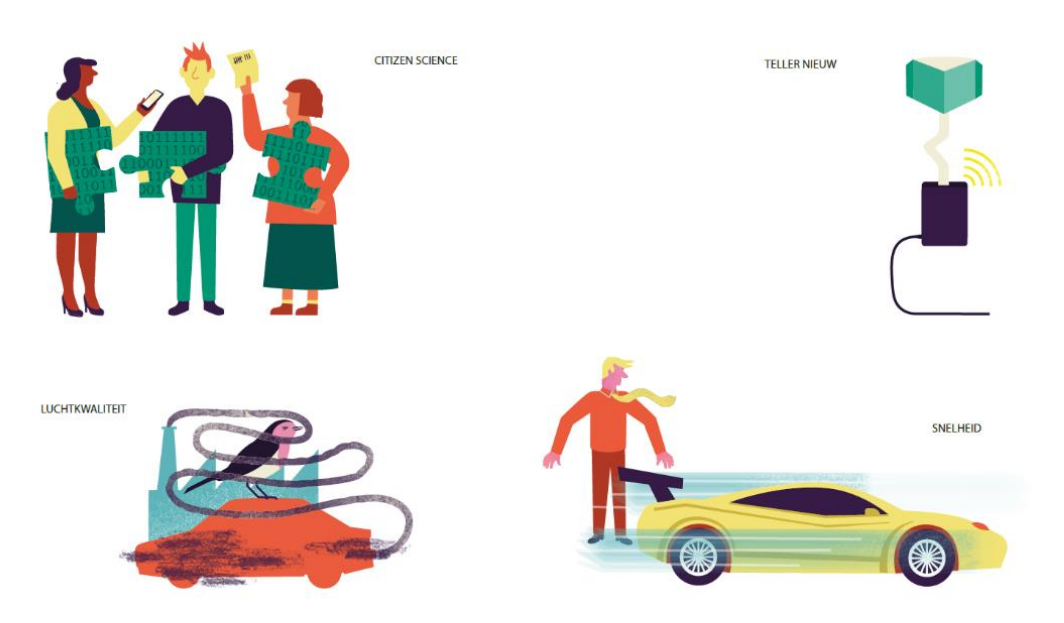
Picture 2. – Example of logos used for explaining the project activities on dissemination materials.