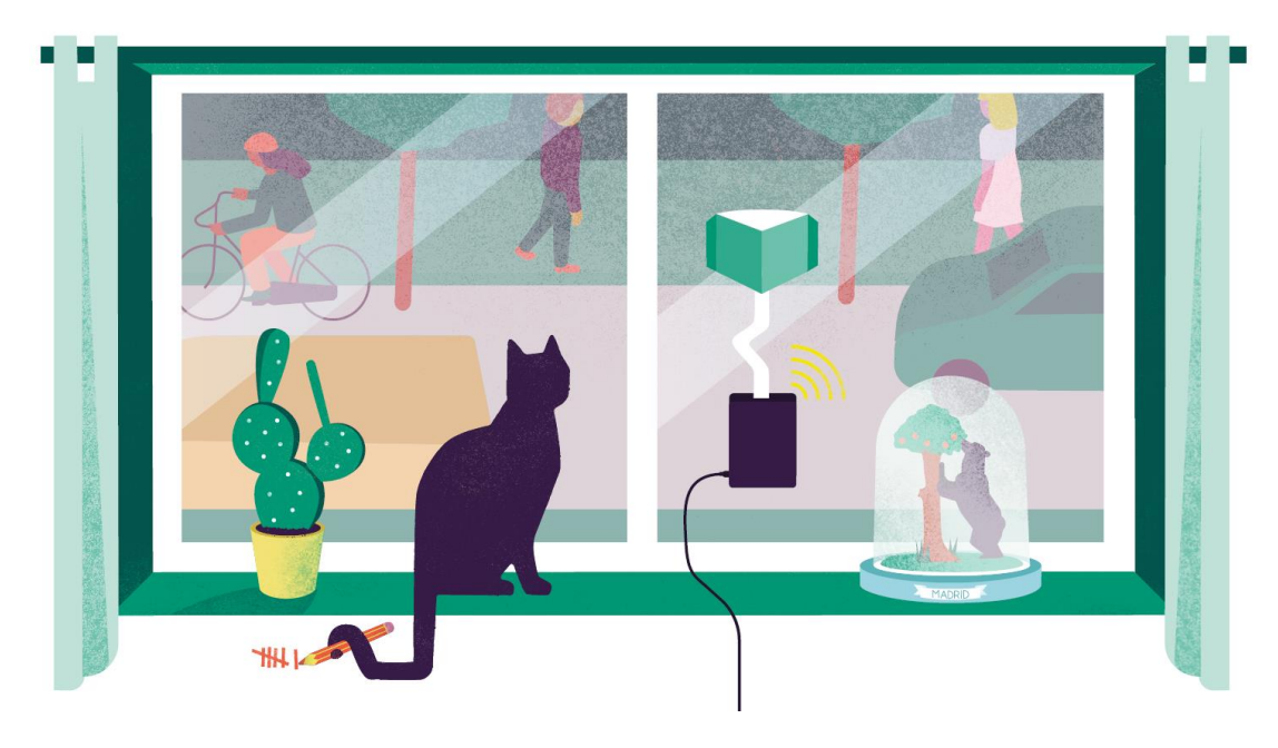
Picture 1. – An example for the design of project postcard, newsletter headings etc.

All relevant promotional material will be available in an electronic format on SharePoint (project leaflet/postcard, newsletters, videos etc.). These materials will be shared with all partners as a communication package to disseminate WeCount to local media. The project partners ensure that all online communication channels are going to be used to disseminate the project's activities and outcomes.